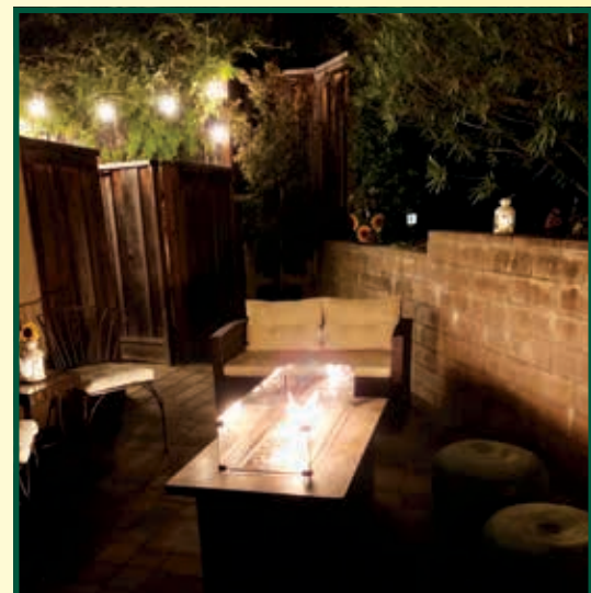
Campfire photo shared by gala participants during the event.